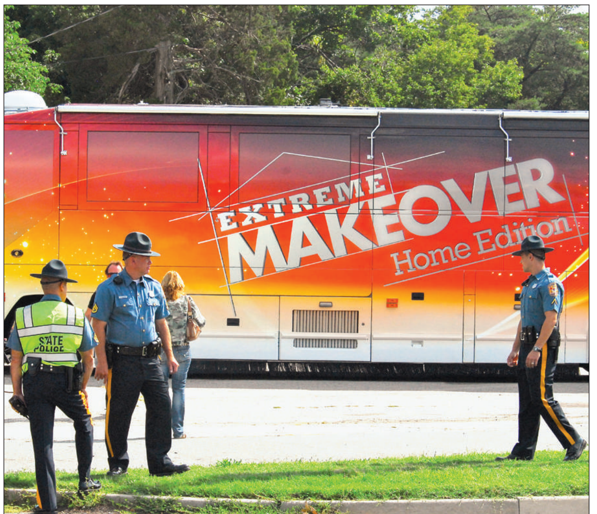
Delaware state troopers provide traffic control and security at the site of the "door knock" at the Rehoboth Presbyterian Church at Midway along Route 1.

For more photographs of the event as it progresses, visit us online at www.capegazette.com .